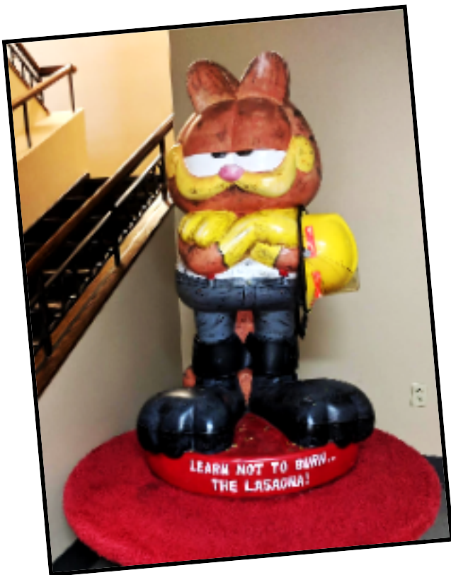
Come find this Garfield statue titled, "Learn Not To Burn...the Lasagna!" in the basement just outside of the Muncie Children's Museum!

Visit Garfield at the Muncie Visitors Bureau, City Hall, and other locations!