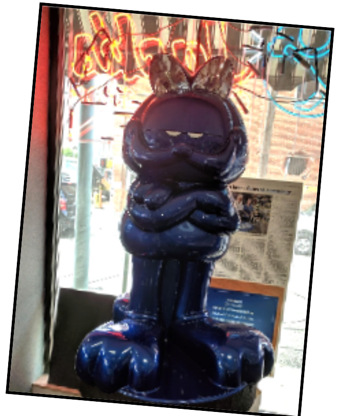
Come find this Garfield statue titled, "Feline Exposed" inside of Jack's Camera Shop at the corner of Jefferson and Main!