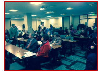
Gathering for Dec 3 meeting