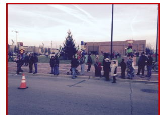
Lighting of the tree