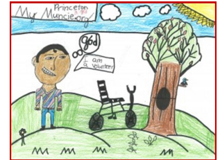
Winner, School Art Contest

Details of the presentation can be found on the MAP website at www.muncieactionplan.org .